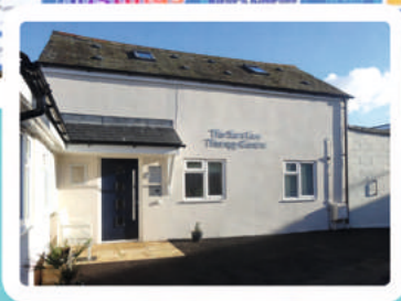
Exciting Building Plans Page 4