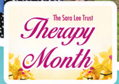
Therapy Month Page 7